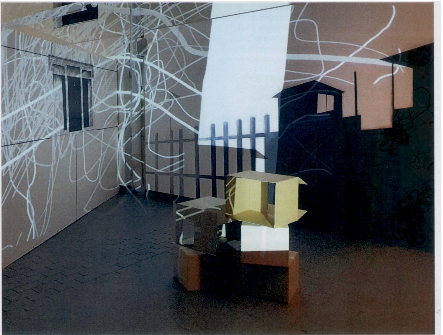
ABOVE and FRONT COVER

Detail from Hardenvale – our home in Absurdia , installed in the Rayner Hoff Project Space, National Art School, Sydney.